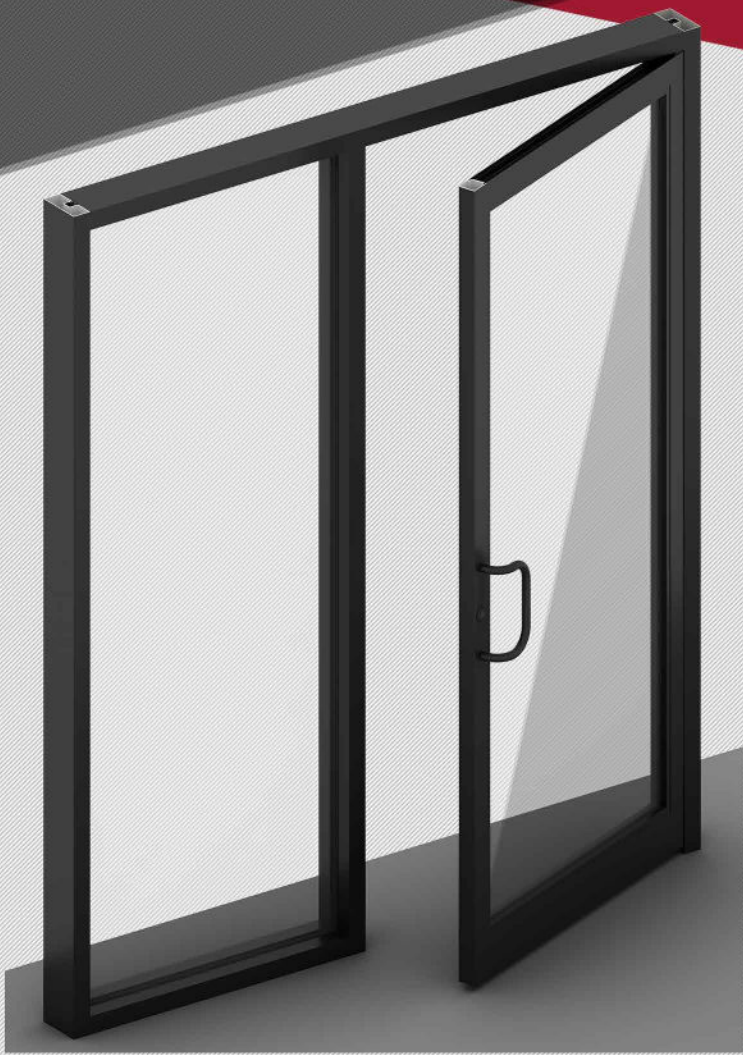
Integrated with Windspec Standard Commercial Door Series