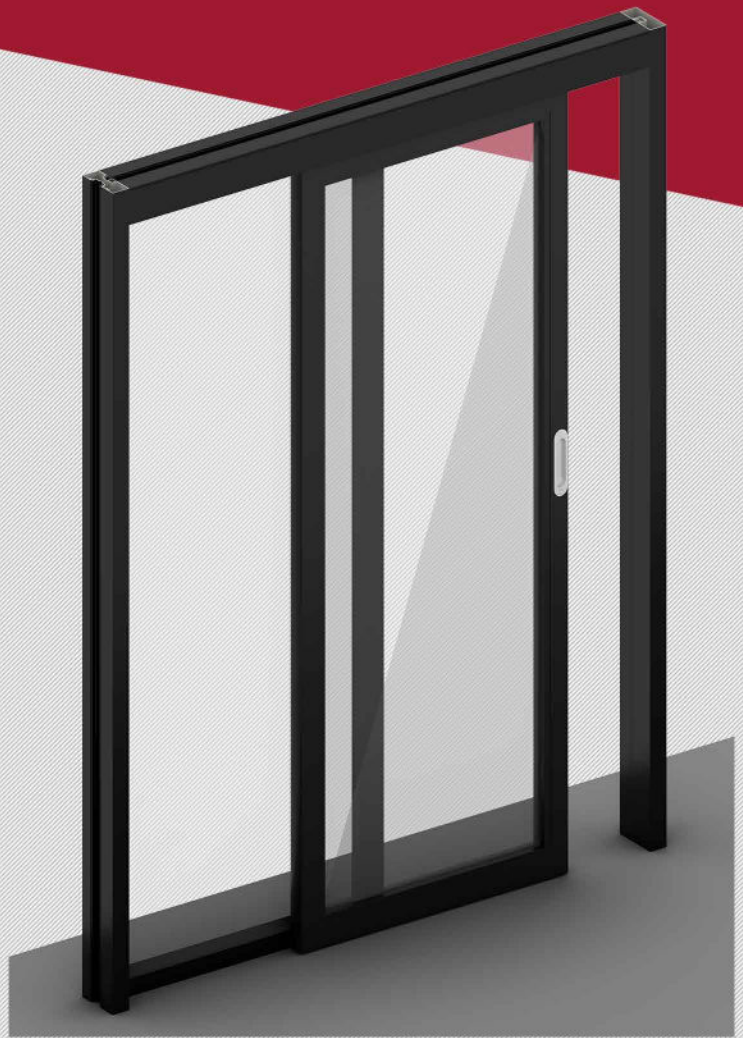
Fully Integrated Top Hung Slider With Soft Close